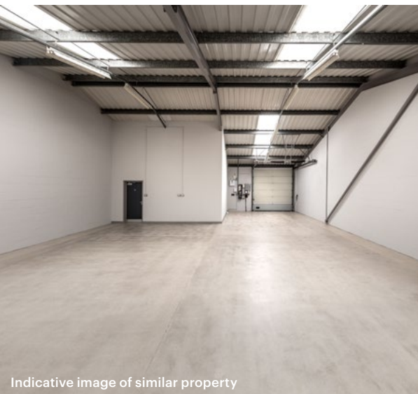
Indicative image of similar property