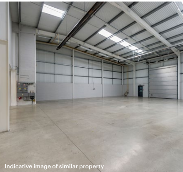
Indicative image of similar property