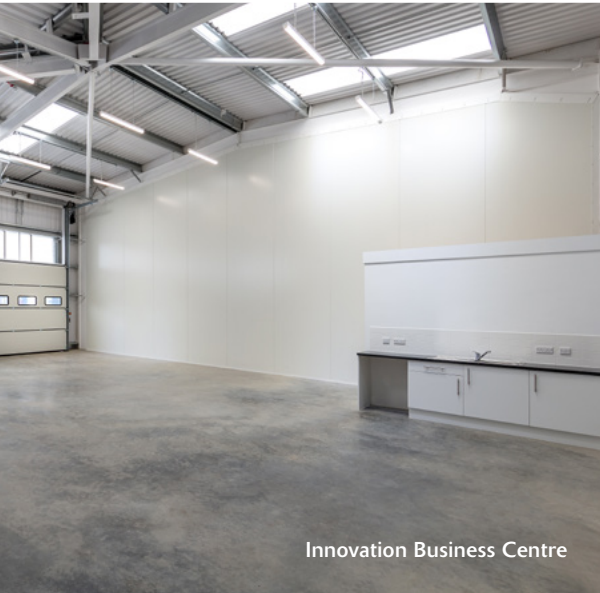
Innovation Business Centre