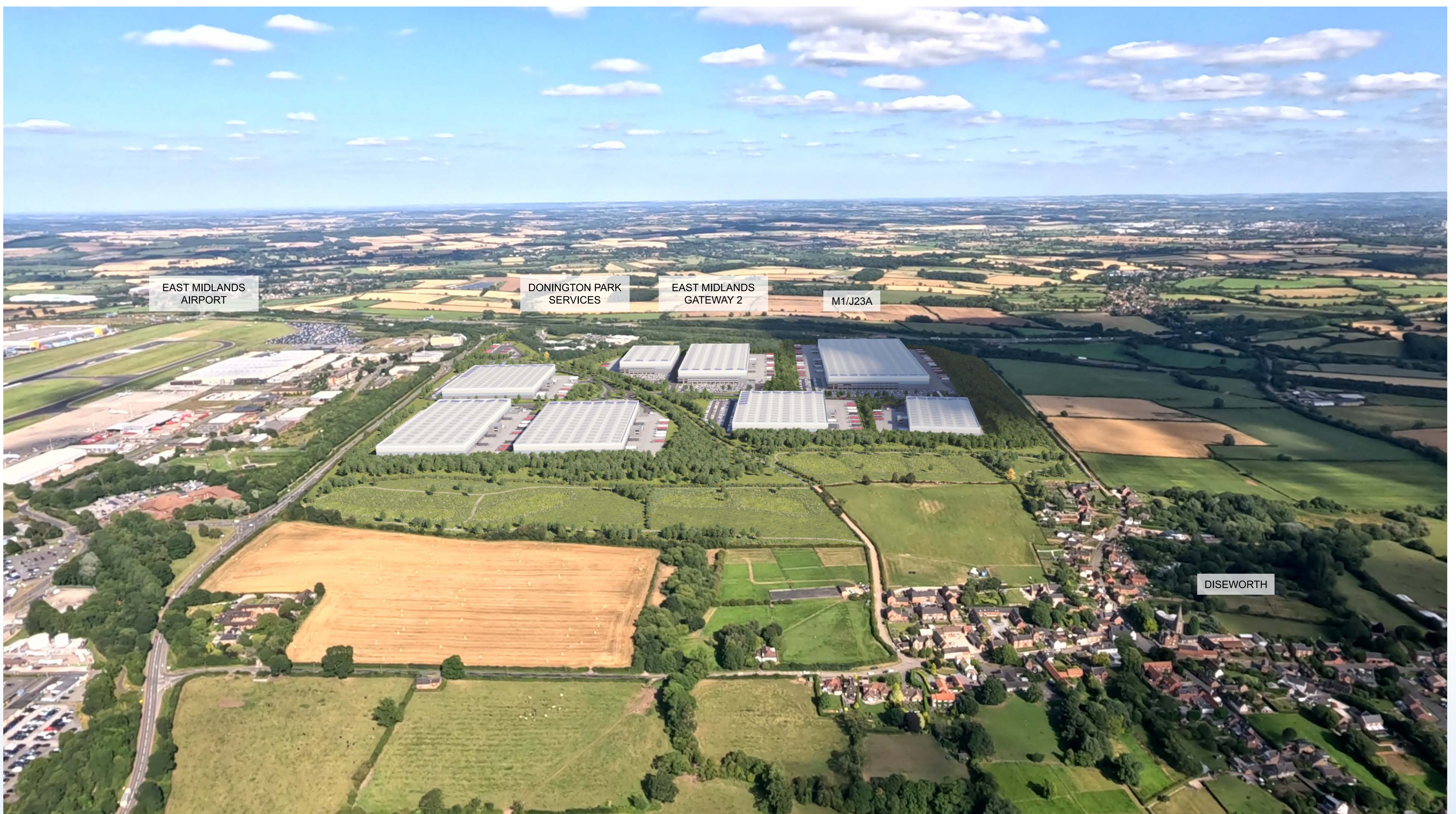
Indicative CGI Images