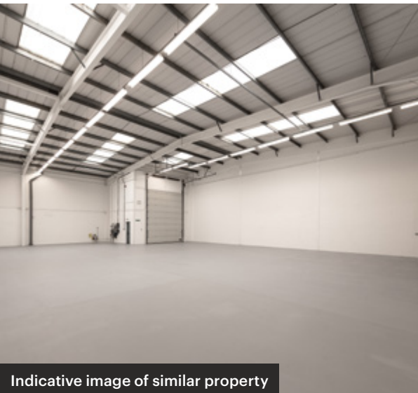
Indicative image of similar property