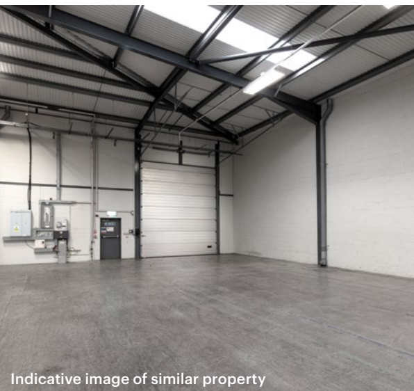
Indicative image of similar property