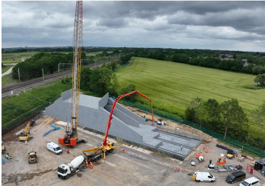
Figure 1 CGI of Underbridge